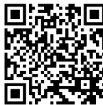
Welcome to St. John's!